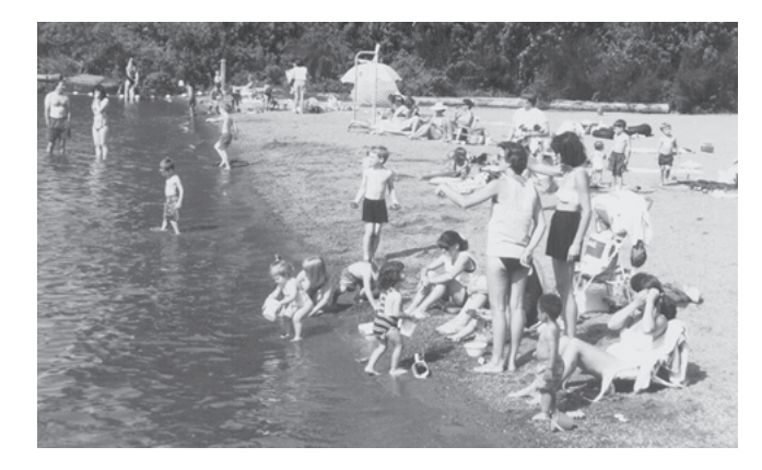
Acquisition and development of public access to the shoreline is emphasized as a community goal.

Discussion: Landfill or dredging may be permitted where necessary for the maintenance or restoration of shoreline property where