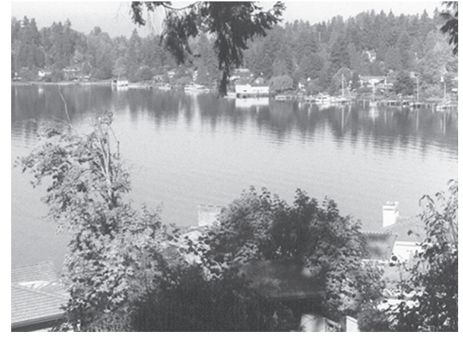
Shoreline policies include regulating new residential construction.

Discussion: Incompatible uses include log boom storage, petroleum or toxic storage tanks, commercial aircraft facilities, and oceangoing commercial ship and barge facilities.