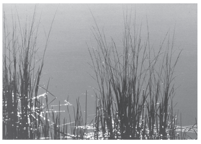
The city's shorelines are a unique and irreplaceable resource.

POLICY SH-3. Give priority to uses and activities which improve or are compatible with the natural amenities of the shorelines, provide public access, or depend on a shoreline location.