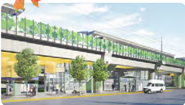
The South Bellevue Station includes a five-level parking structure offering about 1,500 parking stalls. To view an animated video of the East Link extension, go to www.soundtransit.org/eastlink .