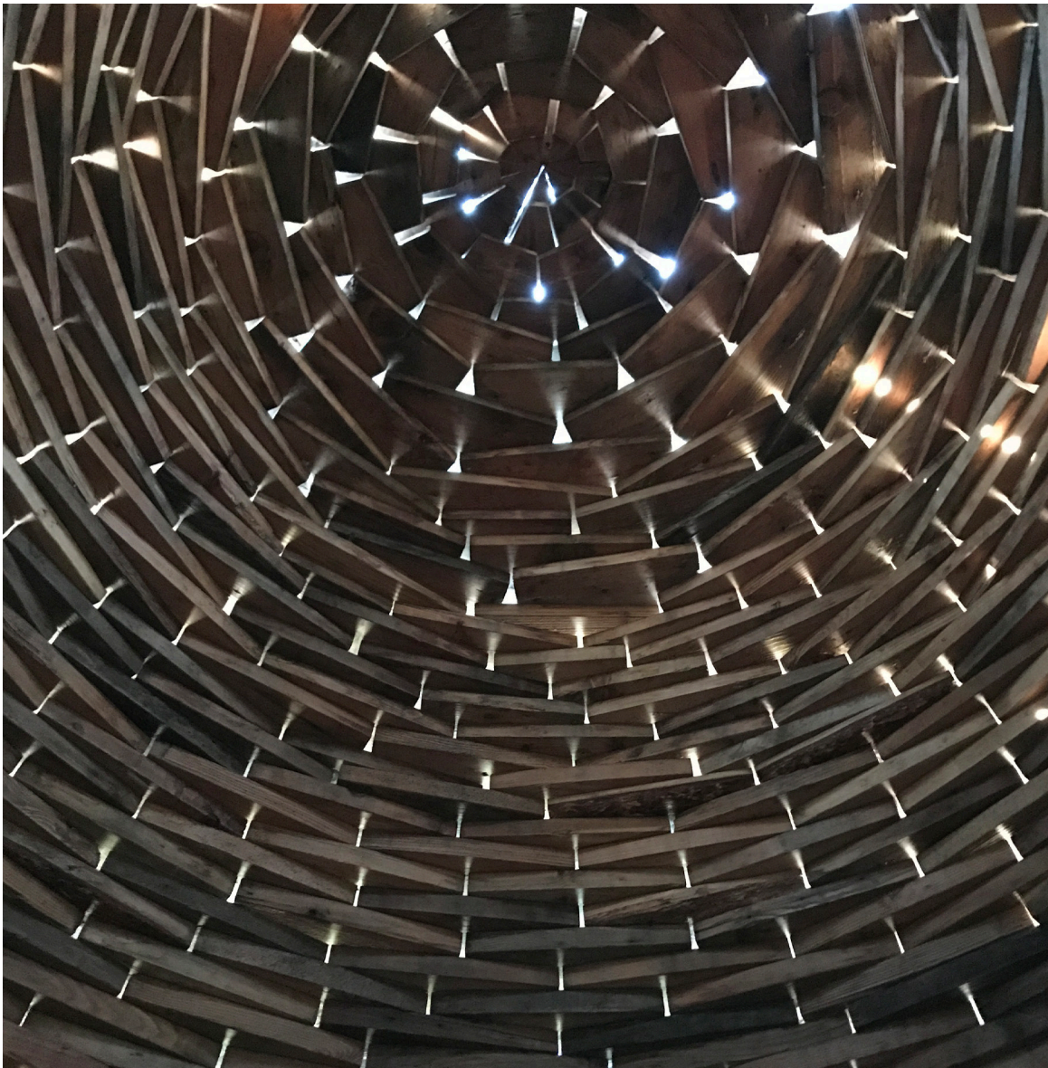
Night Blooming, by artists Taiji Miyasaki and David Drake, was installed in early March at the Bellevue Botanical Garden. The artwork was formerly at the Bellevue Arts Museum and following its stay and was donated by the artists to the Public Art Collection. The above image is from the inside of the artwork. The artwork stands almost 14' tall and is located on the Tateuchi Loop Trail.