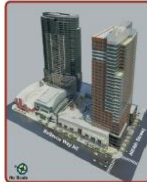
7 Lincoln Square Expansion 410 Bellevue Way NE