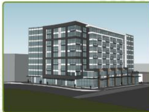
Bellevue Park II Apartments 10203 NE 1st Street