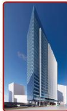
8 Bellevue Center 10833 NE 8th Street