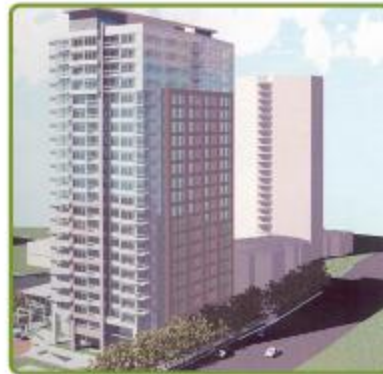
Pacific Regent Phase II 919 109th Avenue NE