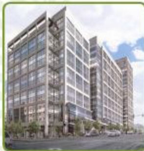
The Summit Bldg C / Bentall 320 108th Avenue NE