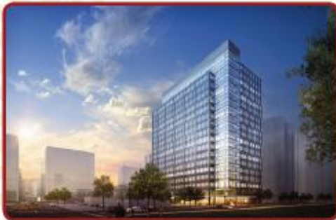
6 Bellevue Office Tower 833 108th Avenue NE