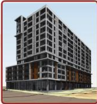
5 Alley 111 11011 NE 9th Street