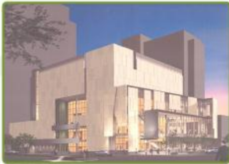
Tateuchi Center 855 106th Avenue NE