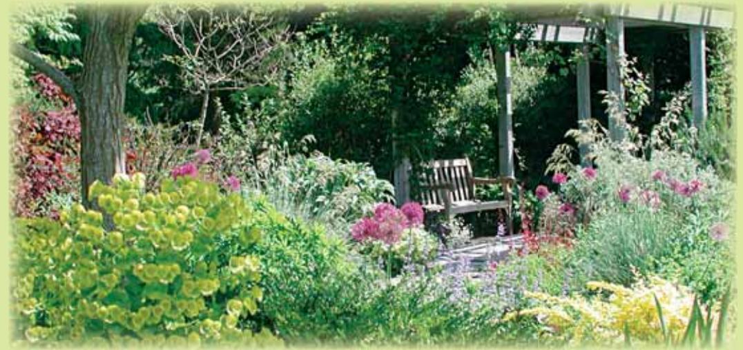
Waterwise Garden at the Bellevue Botanical Garden

Alternate Formats On Request 206-296-4466 | TTY Relay: 711 | 1-800-325-6165, ext. 6-4466