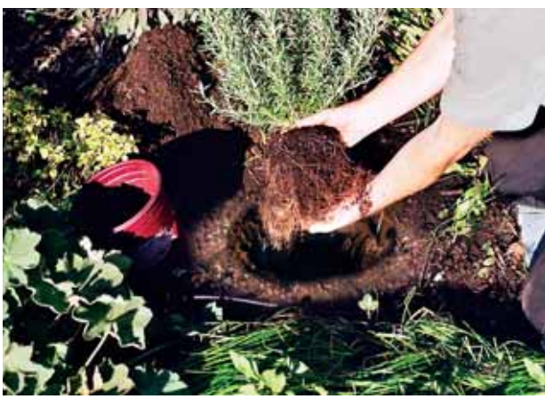
Dig a hole as deep as the root mass and twice as wide, and spread the roots out before planting.

Prepare the soil by mixing 20-25% compost into soil in planting beds. (For trees and shrubs, mix compost into the whole planting bed, or just plant in native soil and mulch well. Don't add compost just to their planting holes – that can limit root growth.) Then spread out the roots, add water, and tamp soil back in for good root contact. Set plants so the soil level is at the same height on the stem as at the nursery, to prevent problems. Mulch new plantings well, and be sure to water even drought tolerant plants during their first few summers, until they build deep roots.