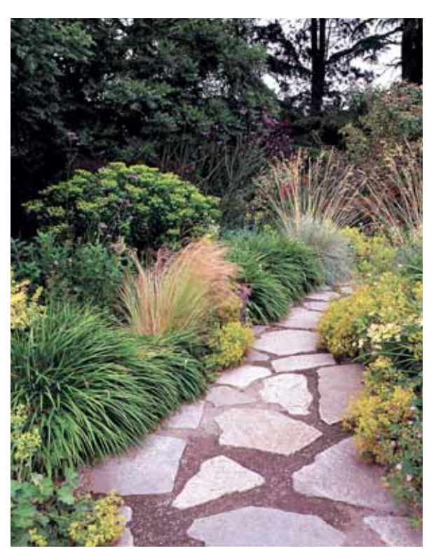
Waterwise Garden at the Bellevue Botanical Garden

Select plants that grow well in the Northwest and fit the sun, soil, and water available in your yard. Native plants are best near waterways, and also work well on many other sites. Think about how big a tree or shrub will be when mature (especially next to houses or under powerlines). Look around at neighbors' yards, nurseries, books, and demonstration gardens for plants that do well in sites similar to yours.