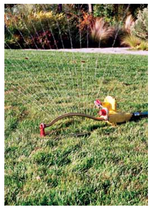
Water in early morning or evening to reduce evaporation.