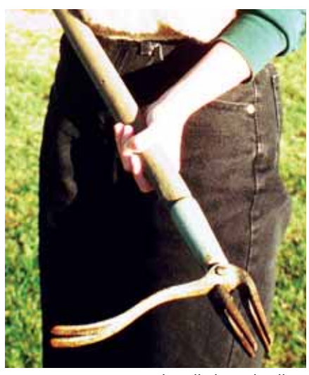
Long handled weed pullers pop dandelions out easily.