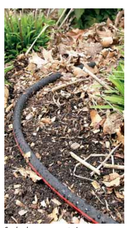
Soaker hoses save water! Cover them with mulch to save even more.