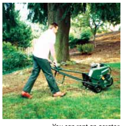
You can rent an aerator, or get a yard service to aerate for you.